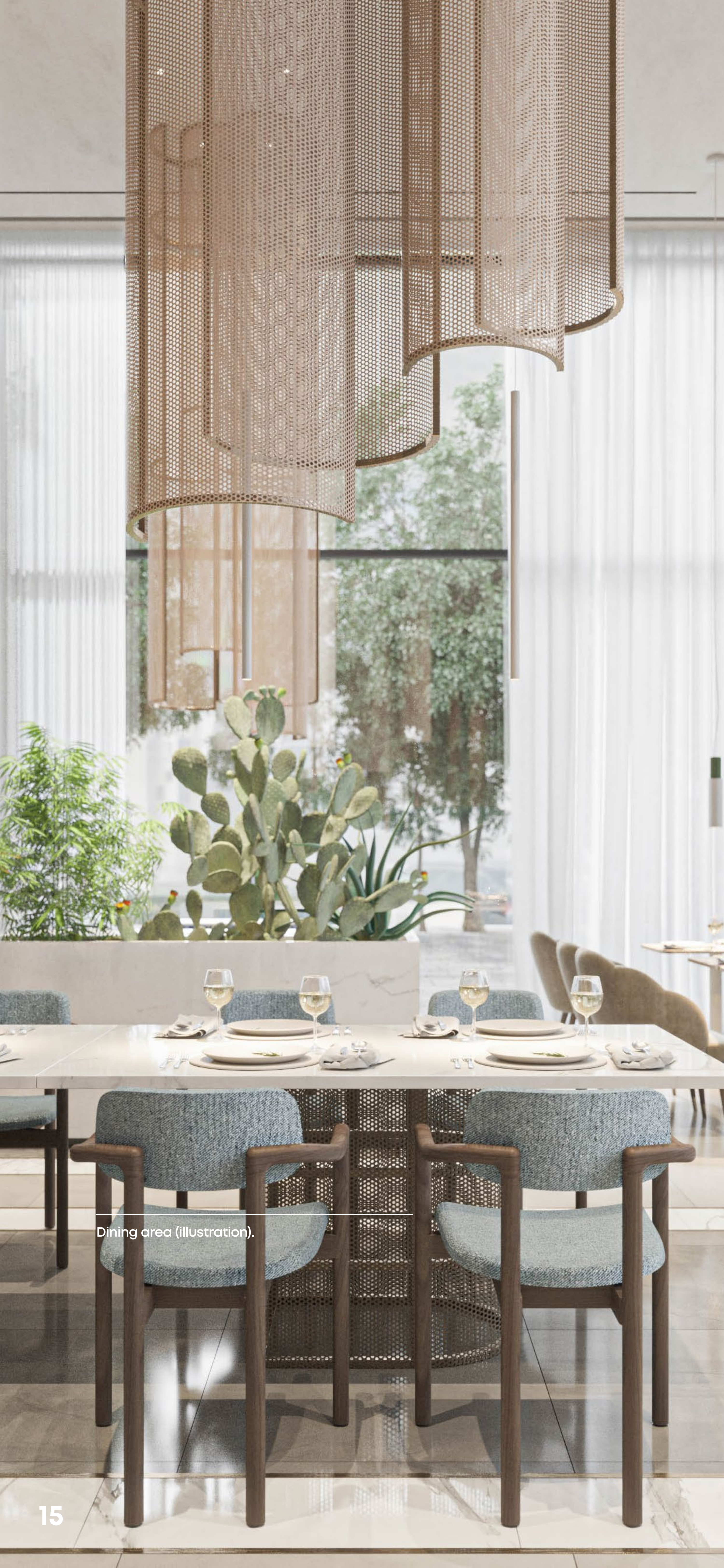
Dining area (illustration).