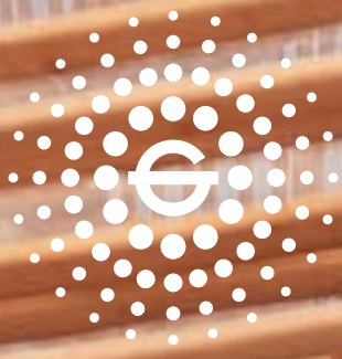
Moussay Beach Club Terrace (photography).