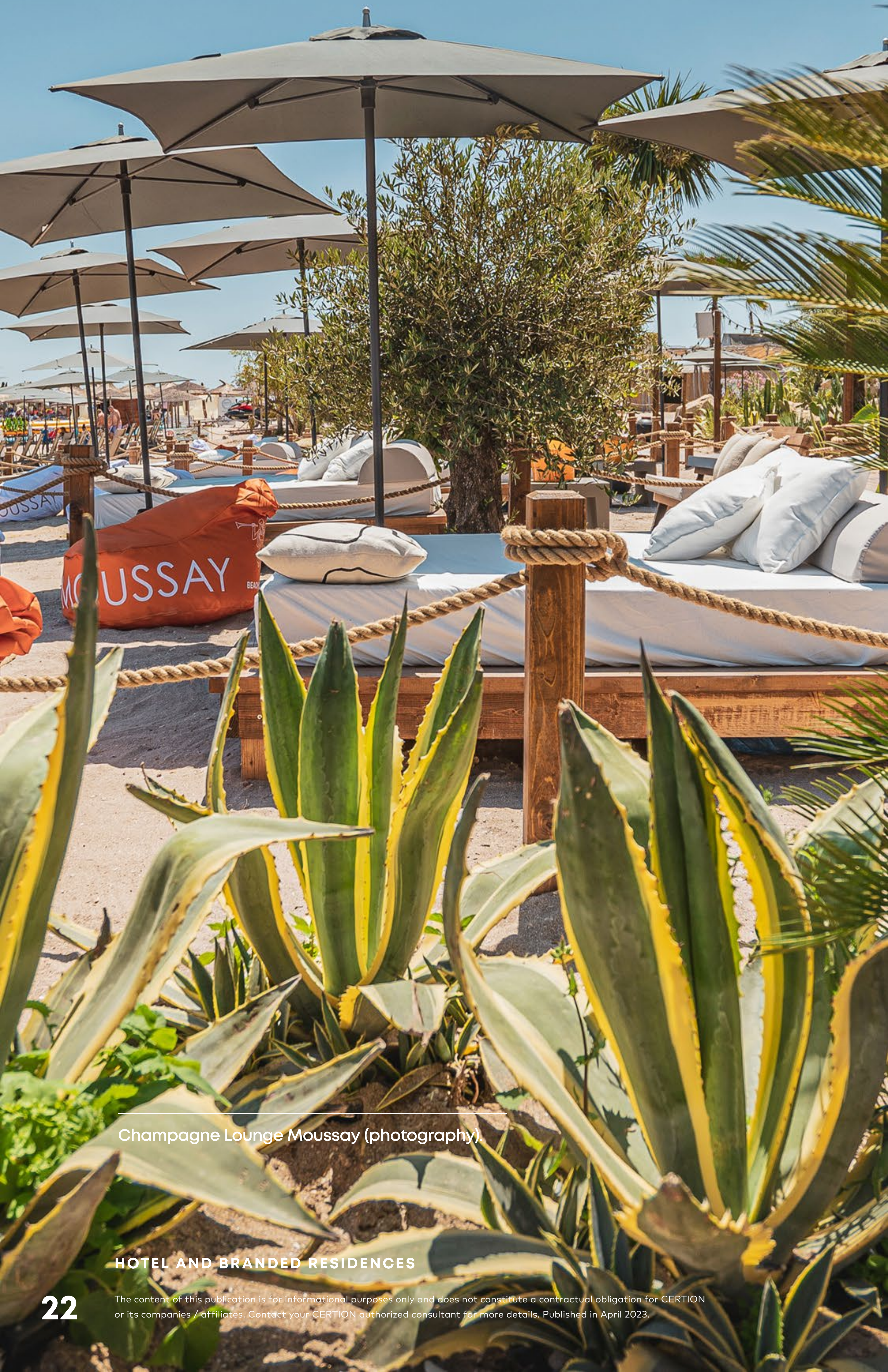
Champagne Lounge Moussay (photography).