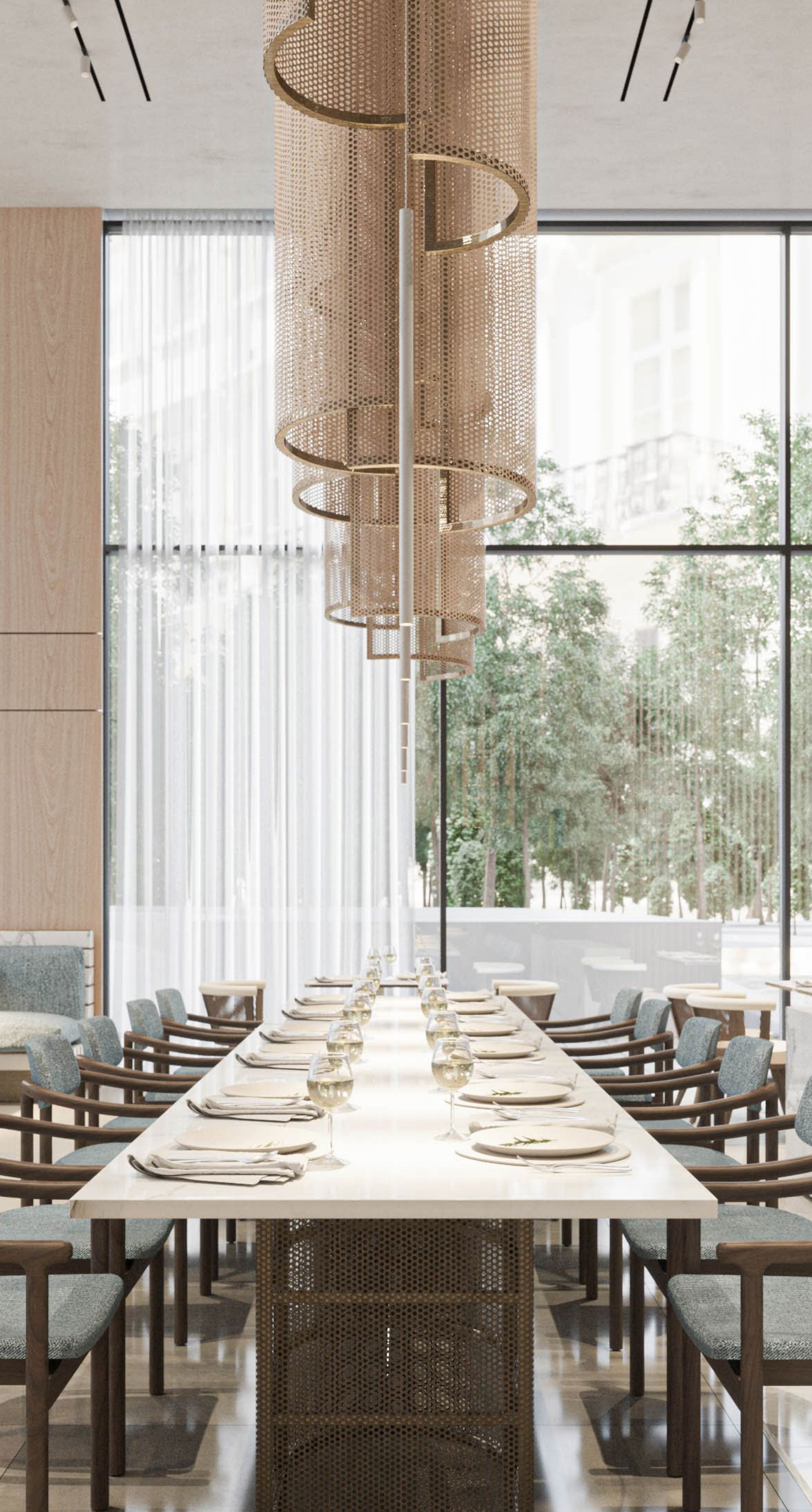
Dining area (illustration).