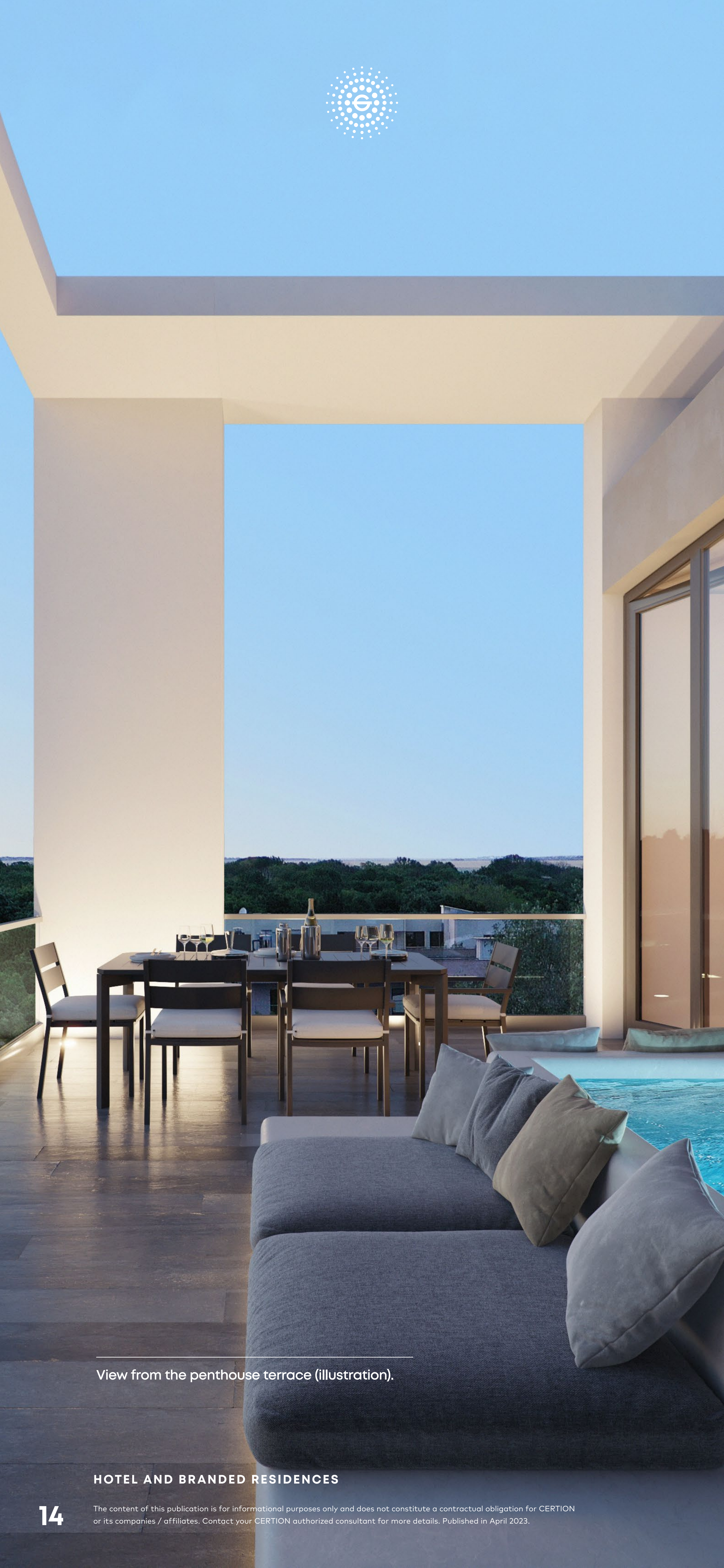
View from the penthouse terrace (illustration).