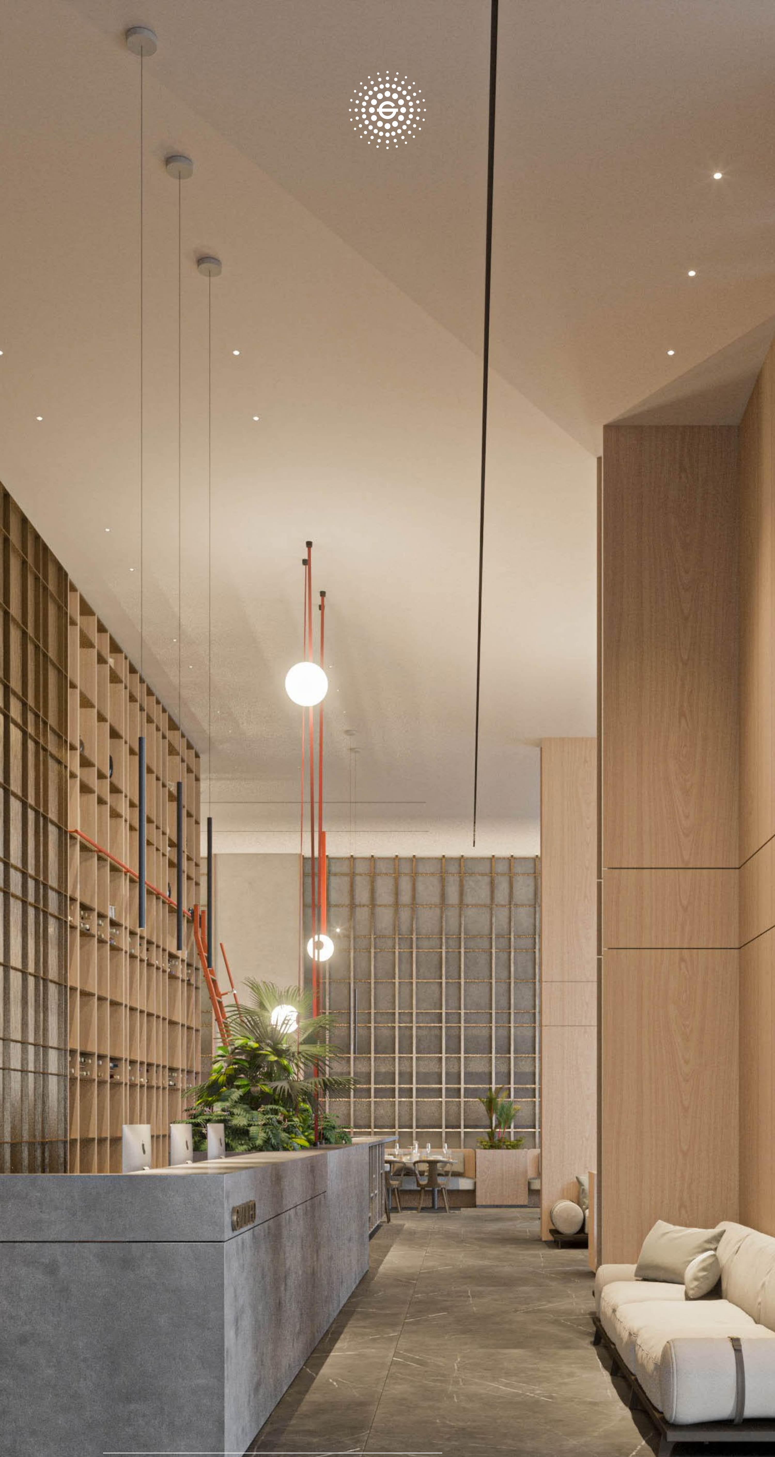
View from the reception (illustration).